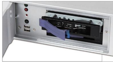
Two Swappable SATA HDD Drives

Convenient to operate or protect the system