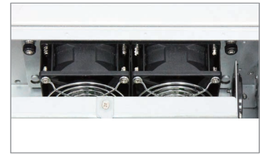
Front Replaceable Air Filters/Fans

Convenient to change air filters or fans when needed